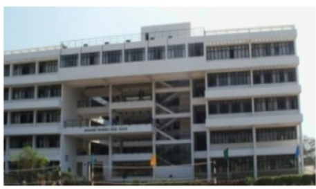
J.C. Bose Block