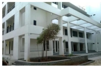
Dr. Sarvepally Radhakrishnan Learning Resource Centre