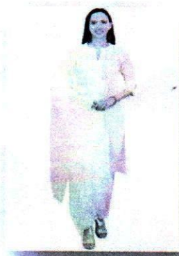
Formal dress with White/Off-White Saree/Salwar Khameez