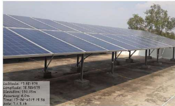
7.1.3.1 SOLAR PANELS