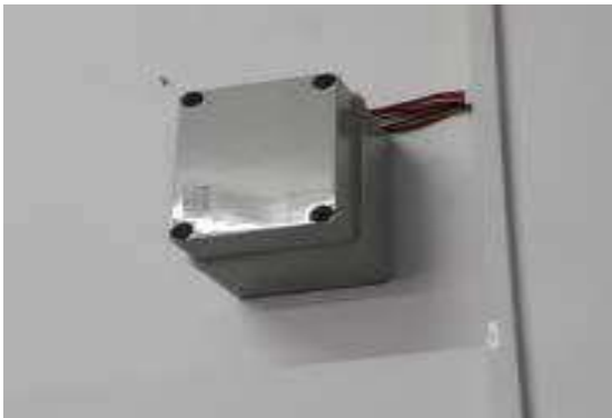
PIR Sensor Switch